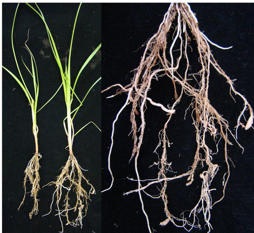
Fig. 1 Meloidogyne graminicola root infestation symptoms on purple nutsedge ( Cyperus rotundus )

measurements of females included L = 650.5 \pm 50.6 (510.7–723.8) \mu\text{m} , stylet length = 13.1 \pm 0.8 (11.5–14.9) \mu\text{m} , and DGO = 3.8 \pm 0.5 (3.2–5.2) \mu\text{m} . The female's perineal patterns (Fig. 2a, b) were oval shape and a low dorsal arch without the presence of a lateral line and the cuticular striations were smooth and thick in the dorsal region of the vulva and phasmids were close together (13.1 to 17.9 \mu\text{m} ). The males were cylindroid and vermiform with a robust stylet, arcuate spicule, and short and rounded tail. Measurements of males were L = 1305.8 \pm 130.5 (1155.1–1602.1) \mu\text{m} , stylet length = 19.1 \pm 0.8 (17.1 to 19.4) \mu\text{m} , DGO = 3.7 \pm 0.6 (2.5 to 4.1) \mu\text{m} , tail = 11.2 \pm 1.9 (9.5 to 14.7) \mu\text{m} , spicule = 31.5 \pm 1.8 (28.1–35.4) \mu\text{m} . The overall morphology and morphometrics of the population of M. graminicola correspond well with the original description (Golden and Birchfeild 1965).